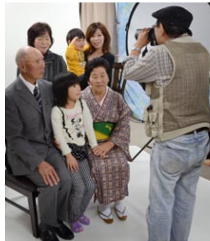
Photo shoot in the "Portrait Photos of Family Members standing out for Recovery" Project

Nikon Imaging Japan Inc. supported "Portrait Photos of Family Members standing out for Recovery" Project, a photography project sponsored by the All-Japan Association of Photographic Societies. Under the project, victims living in temporary housing in Soma City, Fukushima Prefecture, have their photos taken and are provided with a printed album plus a DVD. The project was run for a total period of 14 days between November 2011 and January 2012. Nikon Imaging Japan Inc. provided equipment and assisted photographers who visited studios set up in assembly halls at each of the temporary housing sites.