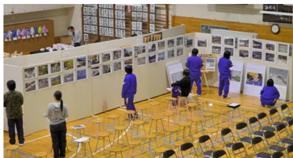
Student photos presented at the school's cultural festival. The gym, where the photos were exhibited, has doubled as a classroom since the earthquake (Toni Junior High School)

Students at Toni Junior High School in Kamaishi City had been actively using digital cameras since just after the earthquake. During the year ended March 31, 2012, under the guidance of their teacher, the students worked on taking photos on three themes: Signs of Rehabilitation, Scars of the Earthquake, and Smiling Faces. They then