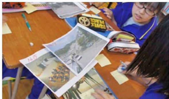
Students choosing photos for their photo book (Toni Junior High School)