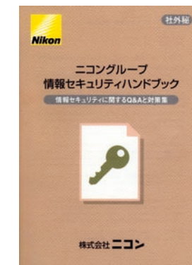
The Information Security Handbook

In the fiscal year ended March 31, 2011, our efforts focused on making overseas Group companies aware of the basic rules of information management.