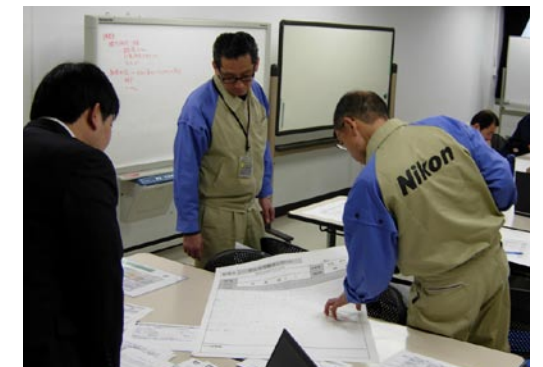
A desktop exercise

Taking advantage of our experience in preventing infection and the spread of infection among employees during the global outbreak of a pandemic influenza (H1N1) in 2009, the Nikon Group revised its action plan to include greater detail and increased awareness of the plan throughout the Group. We are also continuing activities to prepare for the next spread of the H1N1 virus or another highly pathogenic influenza strain. These include information gathering, desktop exercises, and replenishing and increasing medical and emergency stockpiles. We have also established an information system to facilitate information sharing.