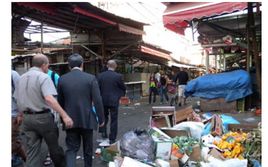
A local tour

We have enhanced our information system to communicate smoothly with employees assigned overseas in case of emergency, and have validated the use of our "safety confirmation system" we use in Japan. We strive to collect the latest information, particularly when it comes to developing countries and politically unstable regions, by, for instance, traveling to the location to confirm local conditions in person before sending our employees there. We also conduct prior training for employees to be sent overseas, as well as special education for managers and emergency drills to enhance risk management training. As one concrete example of the various efforts we are making in the area of risk management, we set up a Nikon Support Desk (phone consultation hotline) to be used by local employees.