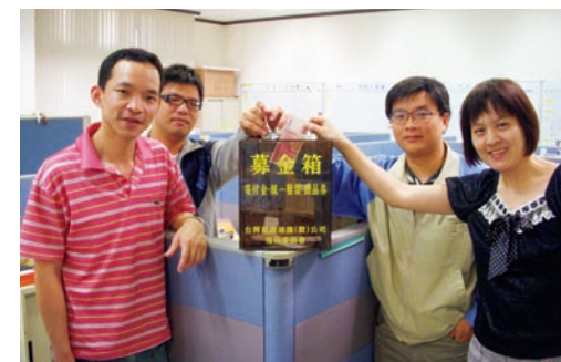
Collection box inside the company

Our employees raise funds by utilizing opportunities including paydays and company events. Together with the money collected, items that are no longer used in the company such as desks, chairs, bookshelves, sofas, and electrical machinery are delivered each month to local social welfare facilities. Furthermore, we collect official Taiwanese receipts (also called "Uniform Invoices") printed with numbers that are entered in a bimonthly raffle to win from 200 to 2 million yuan, and send them to children's institutions. Each of these initiatives is small in scale, but in this way we are continually carrying out activities for our local community.