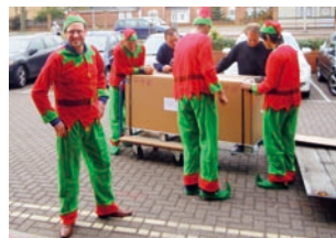
Imaging technicians disguised as elves unload a lens tool. Donations are collected at these company events.

We are raising money in a wide variety of ways: by recycling textiles, dress-down and fancy dress days at the office, used book sales, selling our skills such as sewing, mending, baking and cleaning. The community greatly appreciates our efforts.