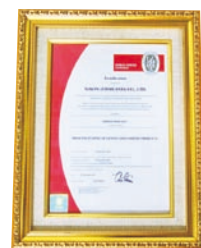
OHSAS 18001 certification