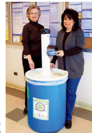
Employees actively participating in recycling activities

Nikon Inc. is making efforts for environmental conservation, with focus placed on recycling, and energy and water conservation. On the recycling side in particular, in addition to toner cartridges, we also recycle batteries that contain toxic substances in an appropriate way in accordance with environmental programs. Outside of our business activities as well, we proactively recycle cans and plastic bottles. Since 2009 we have participated in the Kans for Kids program, the money from which is used to support children with cancer as part of our social contribution activities. We also encourage local high school students to participate in these activities, which have grown significantly as an initiative with cooperation from the local community.