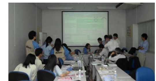
Auditor training conducted at Nikon (Thailand) Co., Ltd.