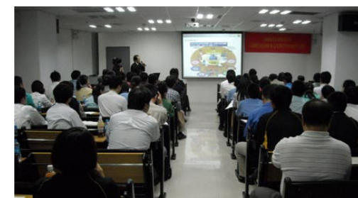
A briefing session for procurement partners in Shenzhen, China

In the year ending March 2012, intra-group green procurement education including Nikon Group auditor training will be enhanced and Group management systems will be reinforced. In addition, the scope of audits and of system development support will be expanded to overseas suppliers to further promote management of the use of chemical substances in products within the supply chain.