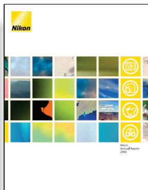
Annual Report 2006