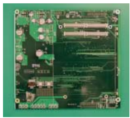
Lead-free PCB for advanced IC stepper