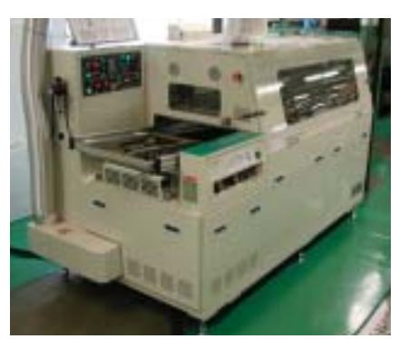
Lead-free flow furnace at Yokohama Plant

The majority of the lead-free solder used at Nikon is the tin silver-copper alloy that has been most widely used in the industry, but with our wide range of products we are also required to use low-temperature tin-silver-indium-bismuth solder.