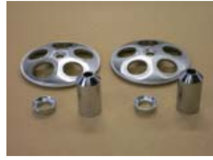
Left: Conventional chrome-plated product (using hexavalent chrome) Right: New chrome-plated product (free from hexavalent chrome)

Surface treatment covers a variety of different types, workplaces and components, and therefore poses a wide range of problems. As Nikon continues to stress the elimination of hexavalent chrome, we are also involved in stringent checks of other substances used in the coating, plating and chemical processes of surface treatment, such as lead and cadmium, and are working to eliminate heavy metals entirely.