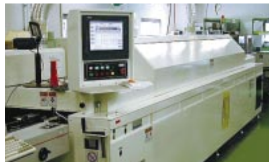
High-performance reflow furnace for lead-free soldering