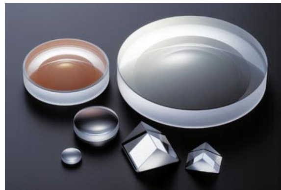
Lenses and prisms made with eco-glass

Nikon is working to minimise the risk of environmental pollution (air, water, soil and waste disposal sites) caused by optical glass containing lead and arsenic, as far as possible throughout the entire product life cycle (raw material production, manufacturing, use and disposal).