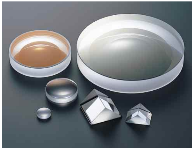
Lenses and prisms made with eco-glass

Nikon is working to minimise the possible pollutants (air, water, soil and waste disposal sites) used in optical glass, including lead and arsenic, as far as possible throughout the entire product life cycle (raw material production, manufacturing, use and disposal).