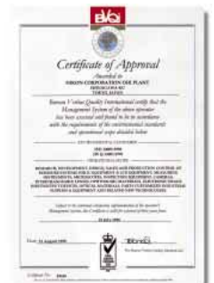
The Certificate of Approval awarded to the Ohi Plant